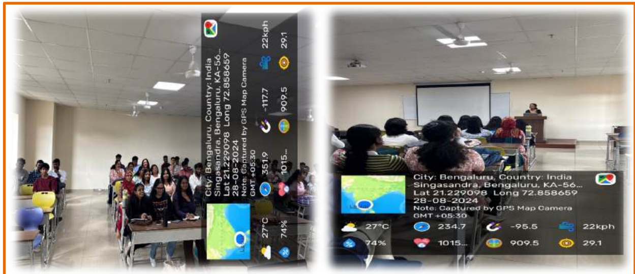
Students Competing in the Legal Trivia Quiz during Orientation Program