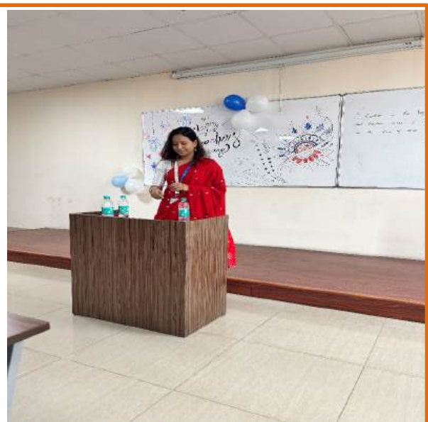
Glimpses of Faculty Participation at the Teacher's Day Celebration