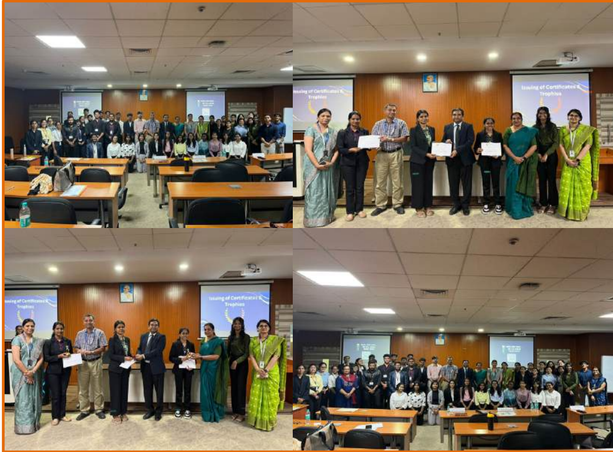
School of Law Students Receive 1st Prize in Debate Competition