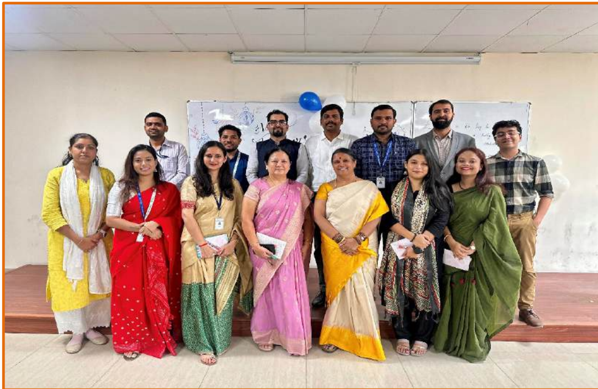
Faculty Group Photo from the Teacher's Day Celebration at SoL, DSU

On September 5th, the School of Law at Dayananda Sagar University celebrated Teacher's Day with vibrant dance performances, interactive games, and heartfelt expressions of gratitude. The students showcased their creativity with traditional and contemporary dances, setting a lively tone for the day. Games like "Flip the Bottle" and "Guess the Song" added fun and camaraderie, fostering a sense of community between students and faculty. The highlight of the event was the Dean's inspiring address, sharing her personal journey into academia and motivating both students and faculty. In a touching gesture, students presented tokens of appreciation to the teachers, emphasizing the strong bond between them. The celebration concluded with a group photo, capturing the joy and unity of the day, marking Teacher's Day as a memorable occasion of respect, admiration, and shared community spirit at DSU.