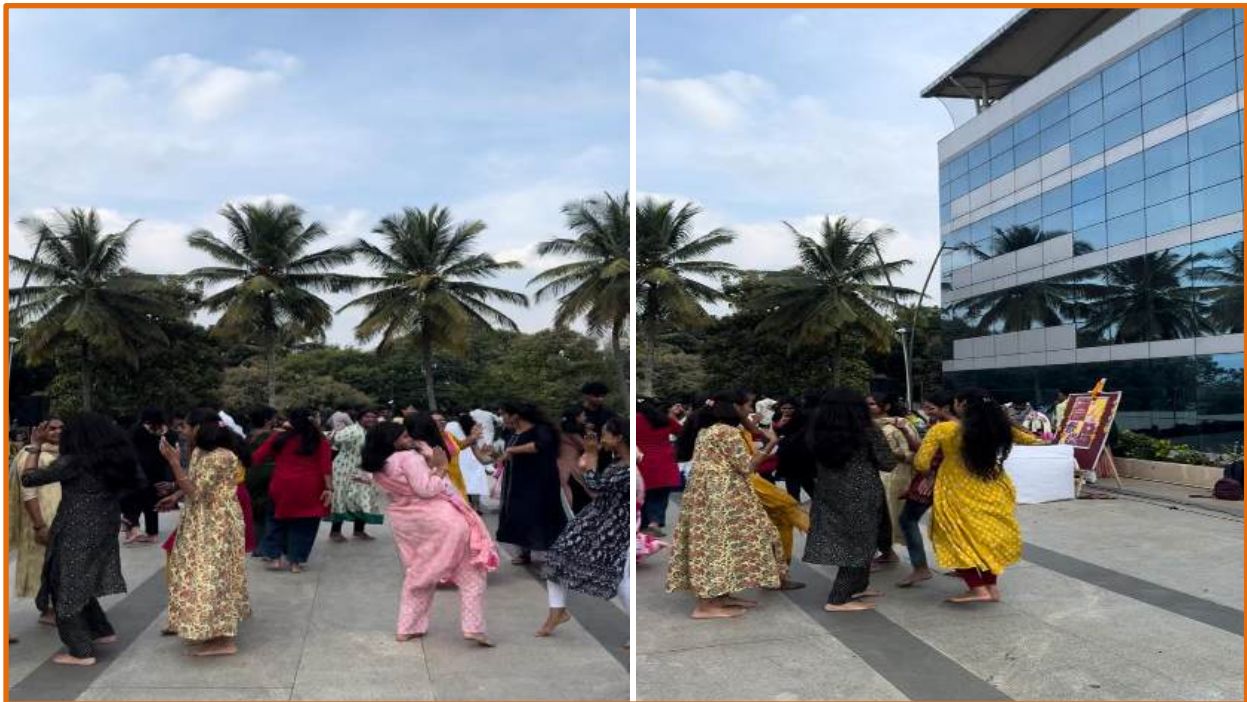
Student's participation Garba and Dandiya

On October 10, 2024, the School of Law at Dayananda Sagar University celebrated Ayudha Puja , a key part of Dussehra festivities , honoring Karnataka's cultural traditions. The campus was adorned with fresh flowers and mango leaves, creating a festive atmosphere. Faculty, staff, and students participated in rituals, offering prayers to their books and study materials, symbolizing respect for learning tools and seeking blessings for wisdom and success. Earlier, on October 8, 2024, the entire university campus came alive with the vibrant Dandiya and Garba celebrations for Navratri . Students, dressed in traditional attire, performed these energetic folk dances to the rhythm of dhol and music. The event fostered unity and joy, celebrating cultural diversity and promoting a sense of togetherness across the DSU community.