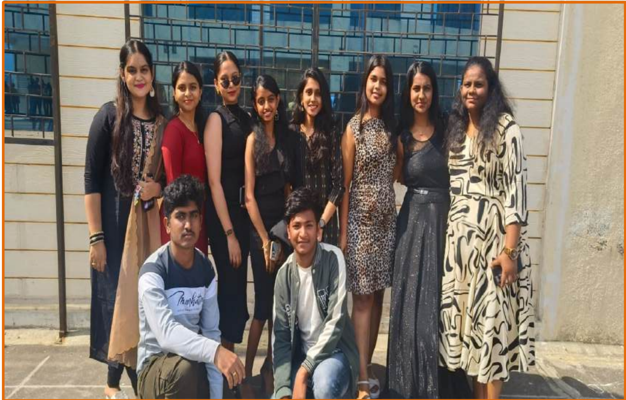
Glimpse of Fresher’s day

On 14th September 2024, the School of Law, Dayananda Sagar University, welcomed its newest batch of students with a vibrant and memorable “Freshers’ Day celebration”. The event, held with great enthusiasm, was a perfect blend of fun, camaraderie, and excitement, setting the tone for the students’ journey at DSU. The day kicked off with interactive games that broke the ice and brought smiles to everyone’s faces. The students showcased their talents through engaging performances—songs, dances, and skits—that reflected their creativity and energy. The atmosphere was electric, with cheers and applause echoing throughout. One of the highlights of the day was the much-anticipated Mr. and Miss Fresher contest. Participants walked the ramp with confidence and charm, faced intriguing questions, and impressed everyone with their wit and grace. After a spirited competition, the deserving winners were crowned, marking a special moment of recognition for their individuality and charisma. The event concluded on a high note, leaving behind memories of laughter, new friendships, and a strong sense of belonging.