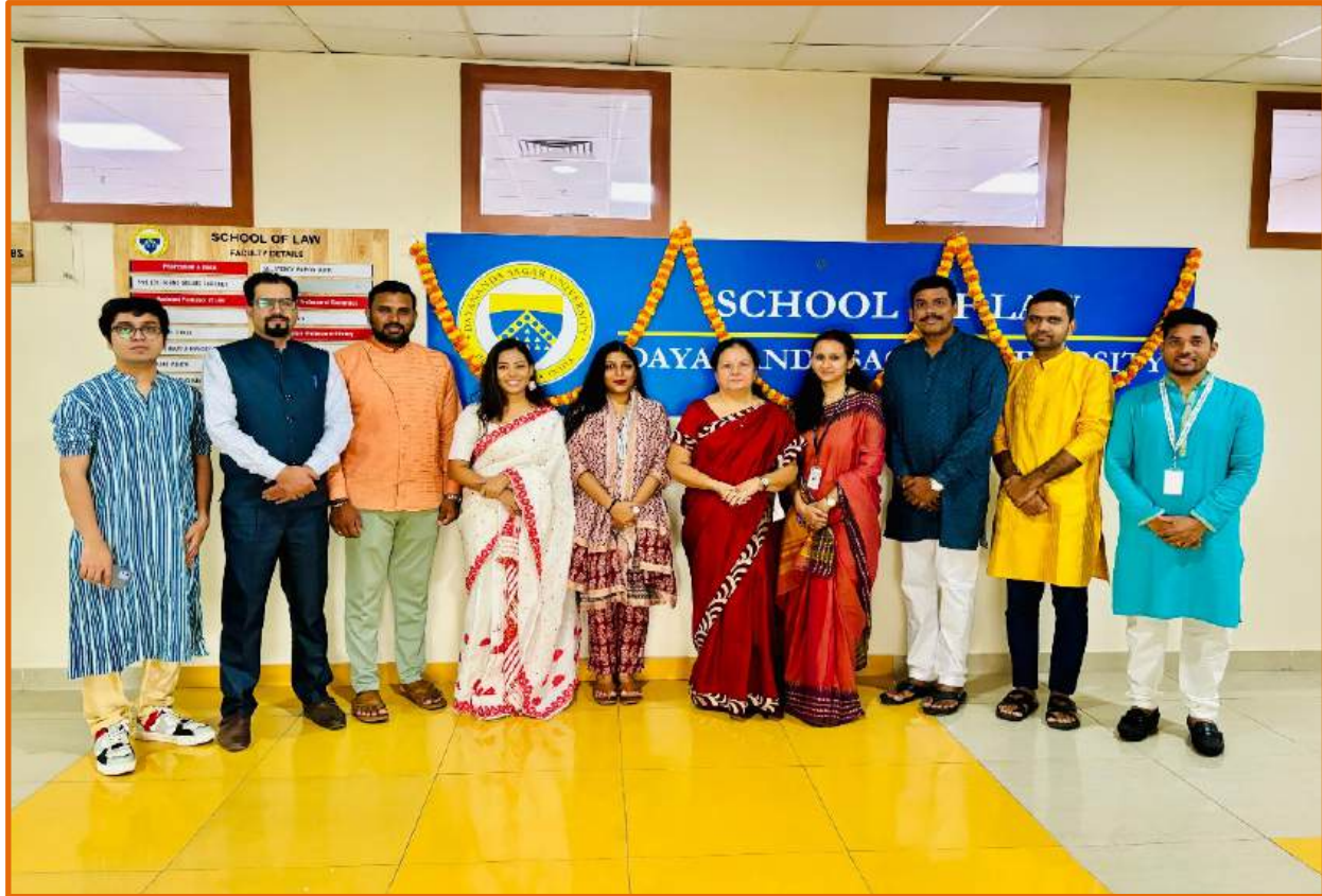
Faculty group photo during Ayudha Puja