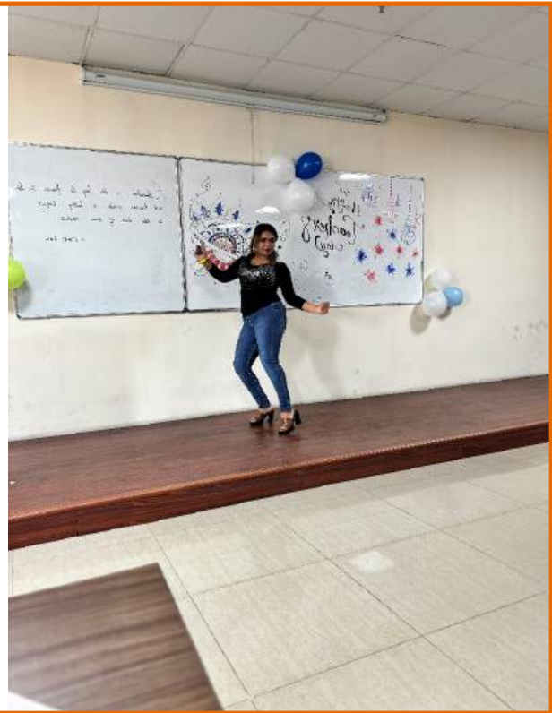
Glimpses of Student Performances at the Teacher's Day Celebration at SoL, DSU