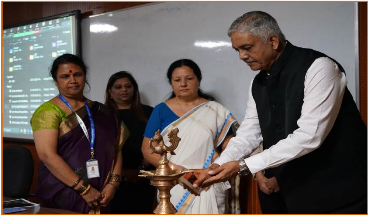
Chief Guest Initiates the Orientation Program by Lighting the Ceremonial Lamp