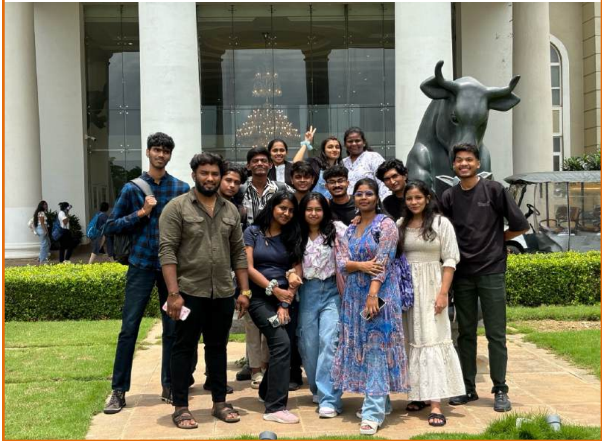
Students at the Cafeteria, Harohalli Campus, DSU