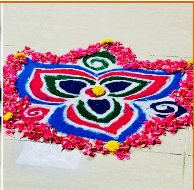
Puja Celebration by Faculty Members